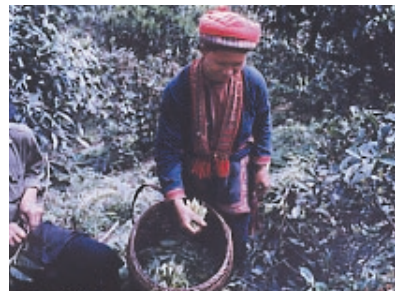
A minority race in China