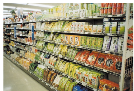
In a supermarket