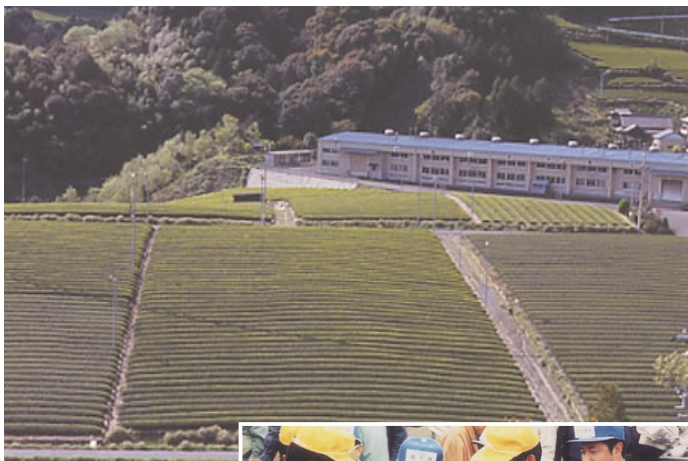
Tea factory in tea field

product and supplied to consumers through the retailers in the third step. Recently, a new route for direct distribution of green tea from crude tea processors to consumers ( mail-order selling ) has been gradually increasing. In addition, green tea beverage in cans and plastic bottles prepared by drink makers are through the retailers and vending machines.