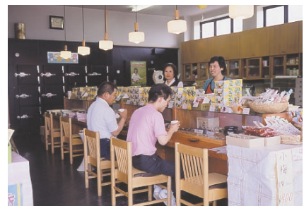
In a specialized store