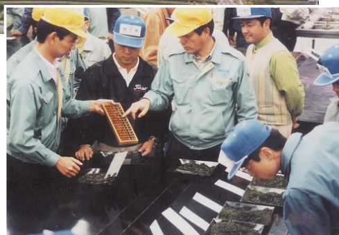
Trading at a crude tea market