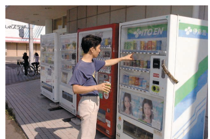
On a street