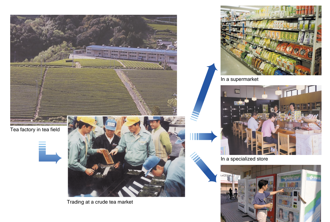
On a street

product and supplied to consumers through the retailers in the third step. Recently, a new route for direct distribution of green tea from crude tea processors to consumers (mail-order selling) has been gradually increasing. In addition, green tea beverage in cans and plastic bottles prepared by drink makers are through the retailers and vending machines.