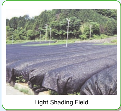
Light Shading Field