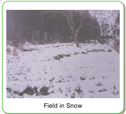
Field in Snow