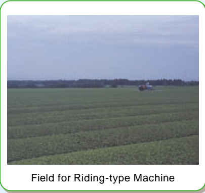
Field for Riding-type Machine