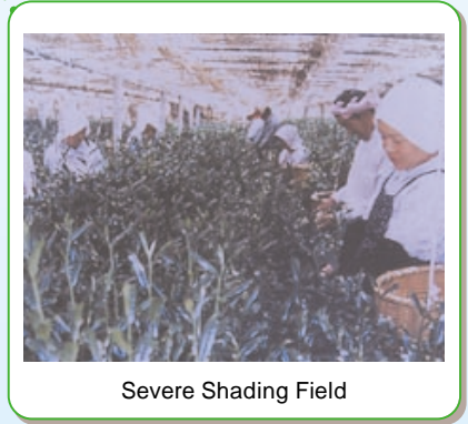
Severe Shading Field