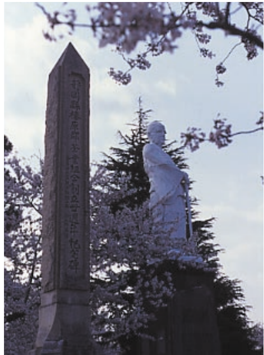
Statue of Buddhist priest Eisai( Kanaya, Shizuoka )

In 1859, when Japanese Government abandoned its policy of isolation and was opened to international trade, green tea became one of the most important exportable commodities along with silk. With the advancement of national modernization of Japan during late of 19th to the beginning of the 20th century, a significant development in the technology of tea production, such as the invention of machines for processing and mechanical shears for harvesting of